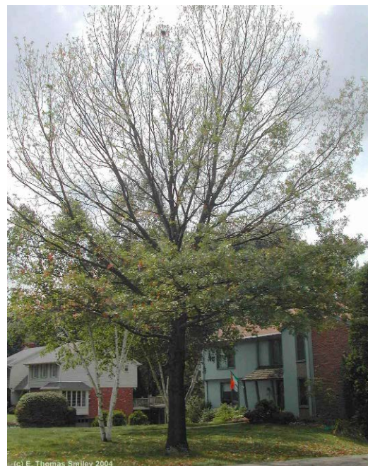
Figure 1: Decline and defoliation caused by oak wilt