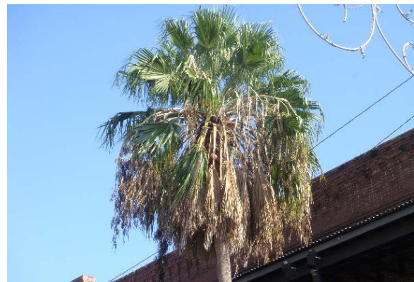
Figure 3: Symptoms of Lethal Bronzing

Symptoms caused by LY and LB can vary depending on the palm species affected. Diagnosing phytoplasma diseases from symptoms alone can be difficult. Generally, symptoms include a yellowing of the foliage that begins in the lower canopy. Yellowing can progress upward until all foliage is yellow. Yellowed leaves eventually turn brown and droop as the infection progresses. Inflorescence (flower) necrosis on mature palms occurs during the early stage of disease.