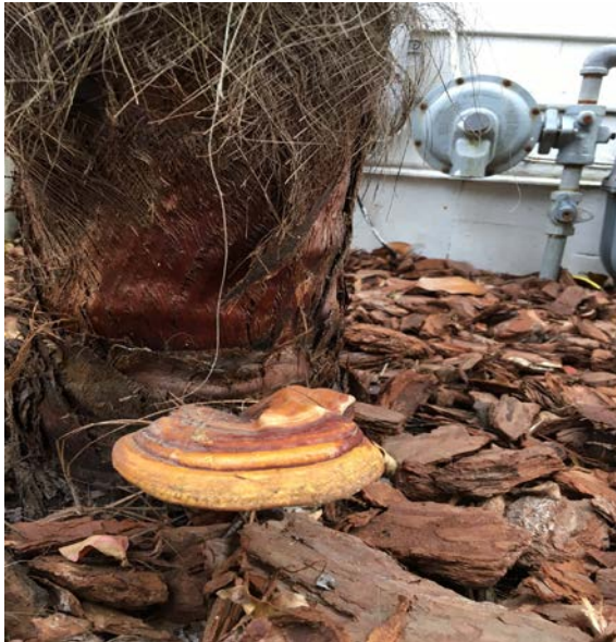
Figure 4: Basidiocarp of Ganoderma on palm trunk

The basidiocarp (fruiting structure) that is produced on the surface of the stem is a key diagnostic feature (Figure 4). Decay may also predispose stems to failure (breakage). No treatments exist for this disease. Remove severely diseased plants to prevent potential failures. Do not replant susceptible palm species on sites where diseased trees were removed.