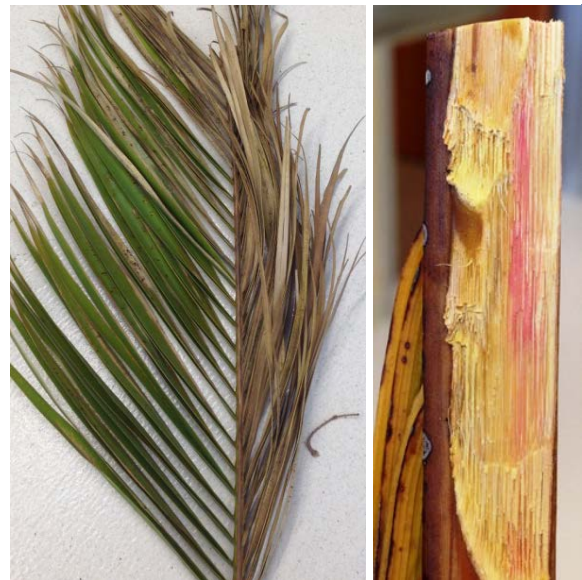
Figure 1: Characteristic symptoms of Fusarium wilt

It is also easily spread on infested pruning tools and is commonly spread during pruning and other maintenance activities.