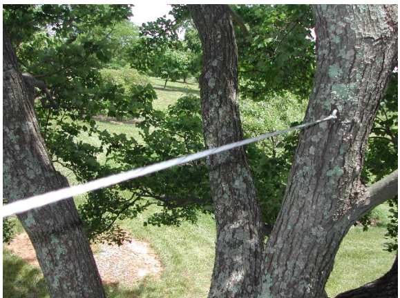
Figure 2: Installed cable

Cable systems minimally consist of a set of anchors (eyebolts), a cable, and the appropriate means of connecting the cable to the anchor (Figure 2). If the tree dictates a more complex system, more cables and/or brace rods may be required. Cables are installed high in the tree, a distance approximately 2/3 the distance between the weak junction and the ends of the branches. Because cables are relatively small diameter and gray in color, they may be very difficult to see. To find a cable it is often easiest to visually follow the main stem looking for the eyebolt.