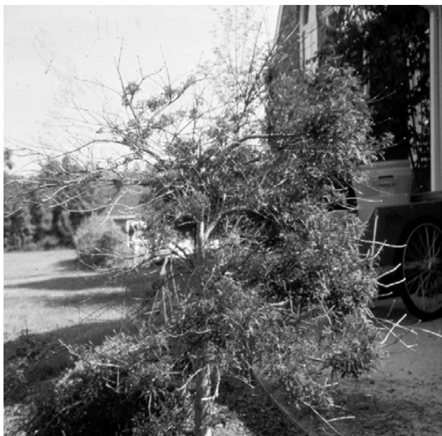
Dieback symptoms in moisture stressed Japanese maple

Eventually shoot growth and new foliage become stunted and chlorotic.